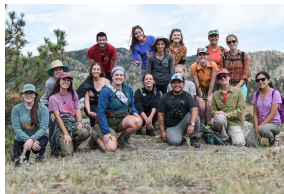
All together now!