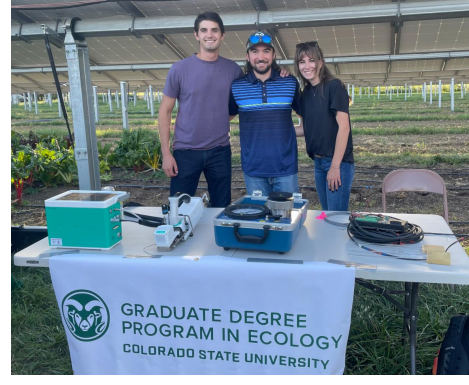
Presenting at Jack's Solar Gardent!