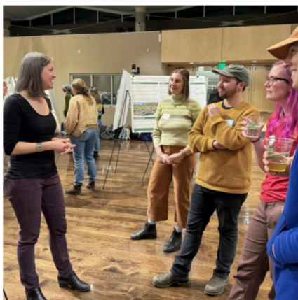
CSU student-run ecology symposium celebrates 30th anniversary