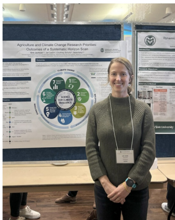
Ecology graduate student recognized for agriculture and climate change research